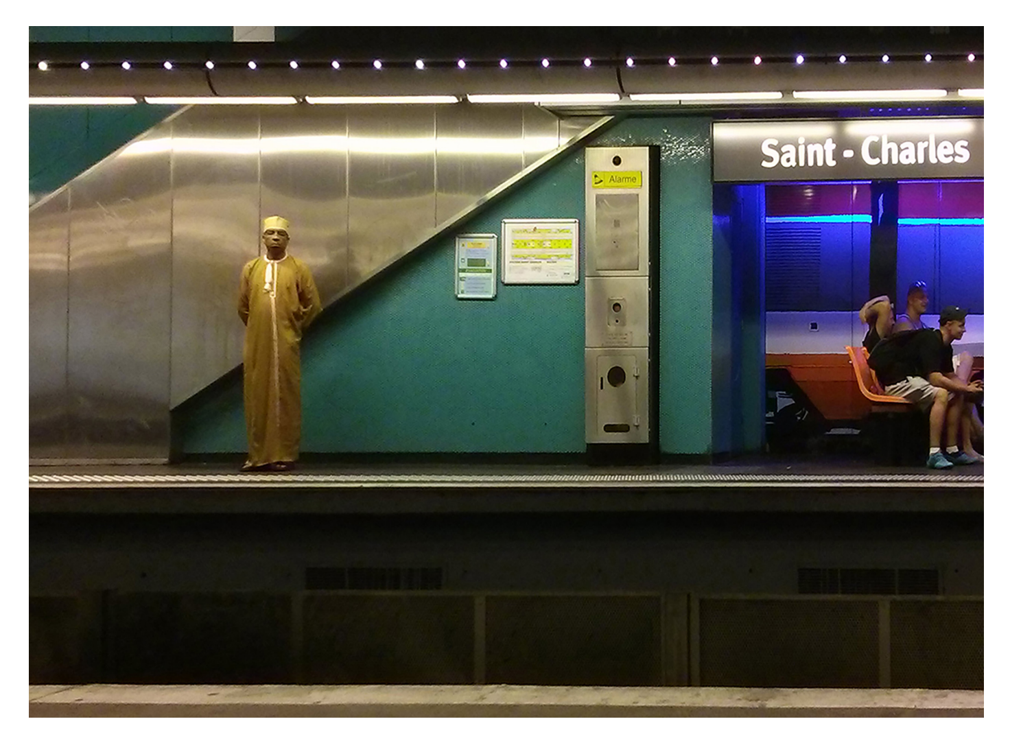
Figure 4: The Patient Man, Saint-Charles Metro Station.

approche totallement alternative à l'approche classique du deployment raisonnée, cohérent, à la grange échelle, maîtrisée....C'est pas que c'est pas bien, mais ce n'est pas forcément adaptée à la manière dont les sociétées Méditerrannéen fonctionne avec une part de désorganization, une difficultée de metre en cohérence, une incivilitée, une individualisme qui est quand meme particulier."<sup>8</sup> Defining an infrastructural path through Marseille is a process of revealing, construction and perpetuating tensions in the spatial and cultural formation of the city as a whole. Marseille forces one to understand that something as holistic as infrastructure is as likely to further fragment the city, as it is to reconnect. It requires a cooperation that is dismissed as futile in a city where individual ambitions carry greater power than metropolitan ones.