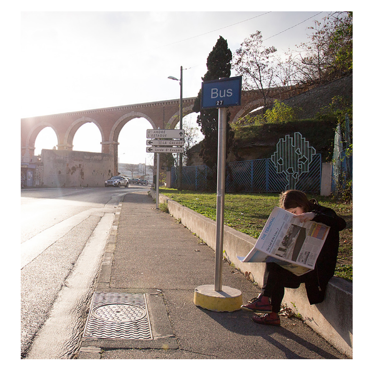
Figure 1: Bus 27, Lycée Saint-Exupéry, Terminus.

On May 5, 2016, Netflix launched the new French series Marseille. Having spent six weeks in Marseille in the summer of 2015, and returned several times thereafter, I relished in the amusing familiarity of the character stereotypes and the often obscure set locations that I happened to recognize from my long and circuitous excursions across the city. Most of my time in Marseille was spent researching the polemics of a planned tram extension into the city's notorious and marginalized "Quartiers Nord." But a good deal of time was also spent indulging in the carefree life of the outsider passing through a Mediterranean city - and one particularly known as a place of passage for outsiders. Fuelled by a dramatic entanglement between politics, industry, sex, mafia and football, Marseille reaffirms the overlapping clichés and half-true reputations through which its protagonist, the city, is almost exclusively perceived. Exaggerated and superficial though these clichés may be, through them the series weaves together the city's fictional identity and its, sometimes indistinguishable, factual reality. A critical online editorial of the