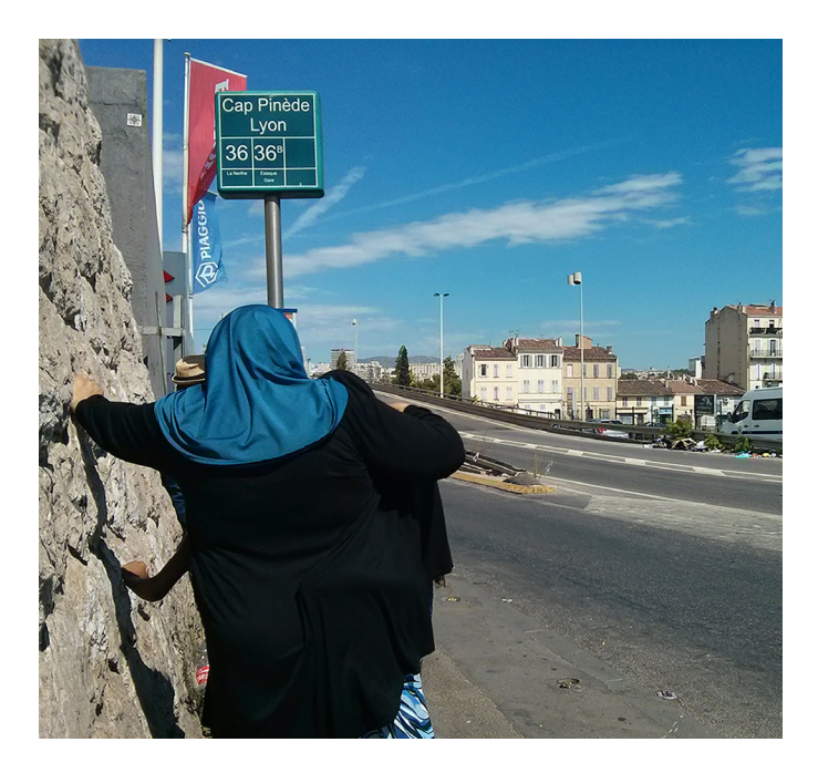
Figure 3: Bus 36 Cap Pinède Lyon, Marché des Puces.

This observation is based on trying to navigate a city whose morphology, and therefore infrastructure, appears to lack any reason or rigidity. In fact, one could draw a parallel between the construction of Marseille's multifaceted identity and the geography and politics of its infrastructure. Unlike Paris, Marseille did not grow outwards in concentric rings anchored by monuments, but rather formed from the eventual connection of small villages scattered around the old city. Different periods of city building now coexist in uneasy relation, a semi-functional sum of parts with no one part dominating the others.<sup>6</sup> Expansion was not steady but rather happened in bursts of development and demolition, eventually forming a massive urbanized area characterized more by chance and