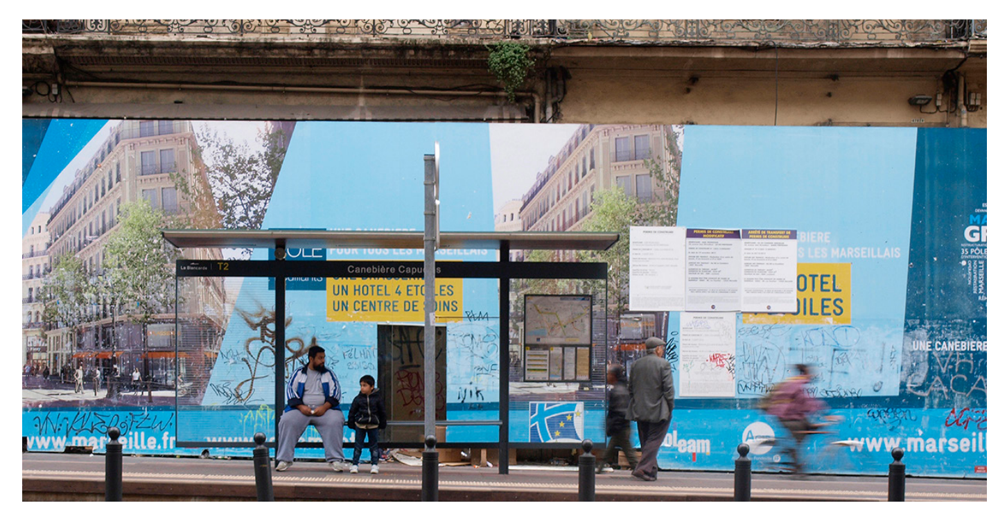
Figure 2: A 4 Star Hotel, Canebière Capucins.

image from one of poverty and crime to one of an attractive metropolitan destination for culture and capital. But relying on the idea of the Mediterranean as a coherent territory (a European concept in and of itself according to Sheila Crane) and as a cultural signifier for urban renaissance is problematic in a post-colonial era.<sup>2</sup>